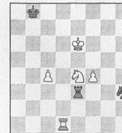
No 18229 A. Garofalo 5th place