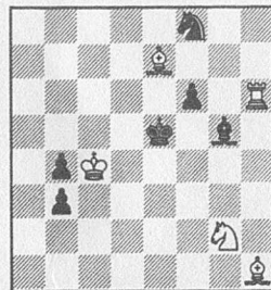
No 18226 P. Rossi 2nd place

– Kf3 9.Sd2+ Ke2 10.Kb3 Kxd2 11.Kxb2 Kd3 12.Kb3 draws.